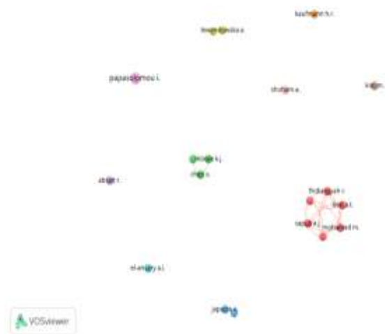
Figure 3 List of Authors